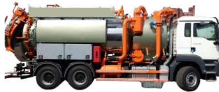
Super Sucker Truck