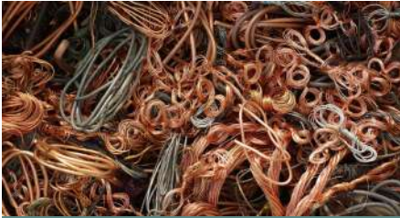
Copper Scrap Metal

At Jubail Future , we are committed to sustainable construction practices, including responsible recycling of scrap materials. Our dedicated program offers competitive rates for all kinds of scrap materials, ensuring they are diverted from landfills and promoting environmental responsibility.