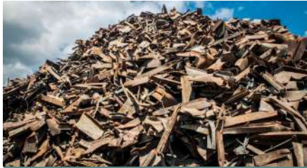
Heavy Melting Scrap